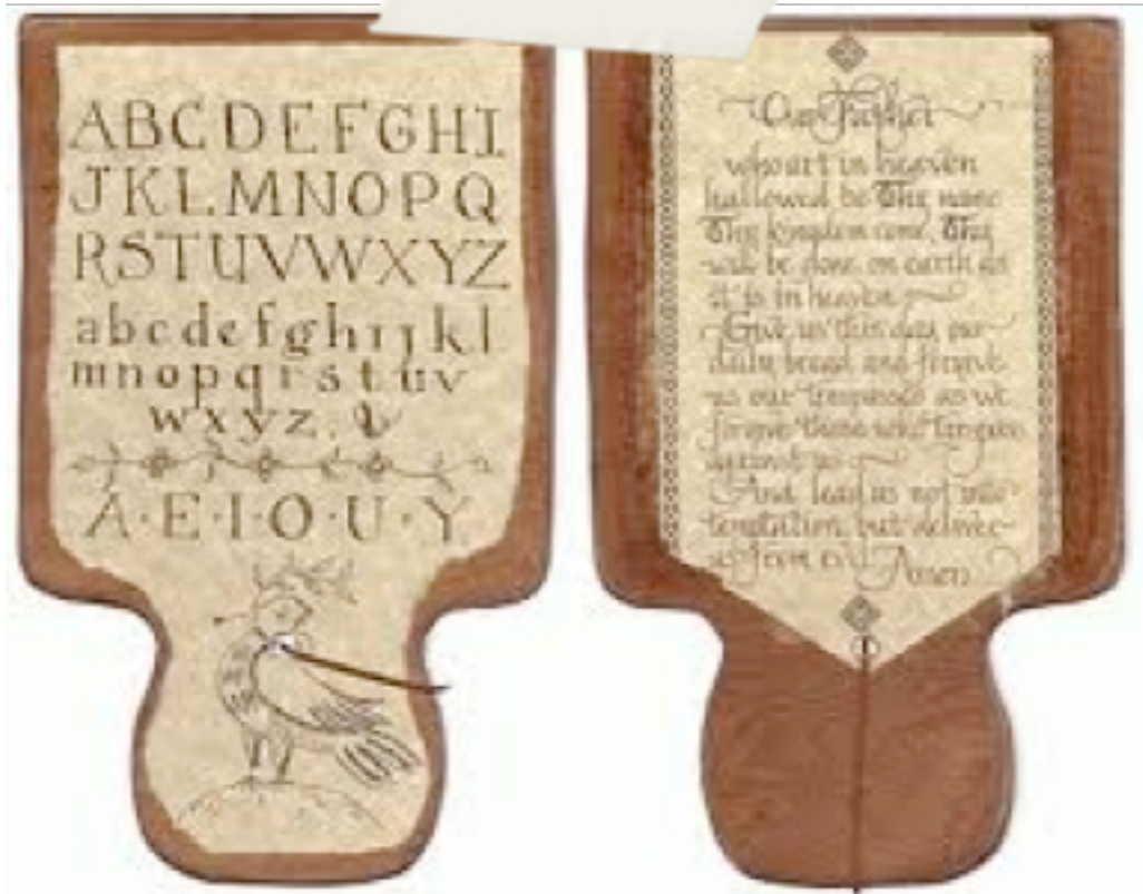
Hornbook used to teach the alphabet to children